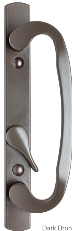
Dark Bronze (Patio Door only)

Due to limitations in the printing process, actual colors may vary from printed materials. Please see a sample of the product before making your final color selection.