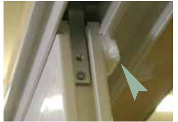
Fin seal pad