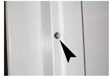
Pre-drill holes into panel through two-stepped holes in astragal.