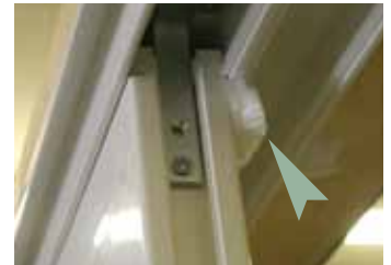
Fin seal pad